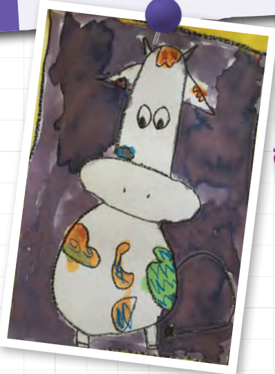
Creates artworks by drawing and painting