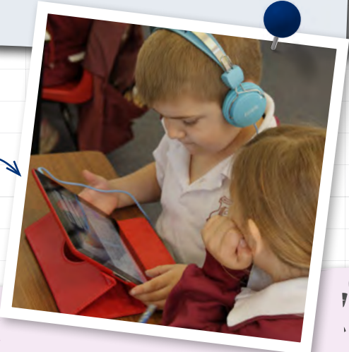
Uses a tablet to sequence steps